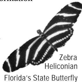
Zebra Heliconian Florida's State Butterfly

This brochure includes information on the types of plants needed to start a butterfly garden and will introduce you to just a few of the species of butterflies that are found in south Florida. Once you have an active butterfly garden, you may want to learn the butterflies you are seeing. Close-focusing binoculars and a good field guide are essential for this effort.